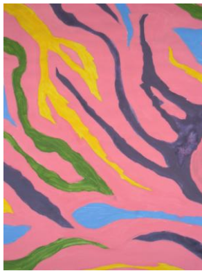
Chika, Grade 7 Gouache on paper

In Art this term, the Grade 7 and 8 students have been looking at Pop Art, with a focus on the work of Andy Warhol. We studied Warhol's series of camouflage paintings and then set about creating our own camouflage works, drawing inspiration from fabric designs and animal prints as well as the artist's original work. This resulted in a wonderful variety of colourful paintings inspired by zebras, giraffes, tigers and leopards, camouflage patterns and, of course, the students' imaginations.